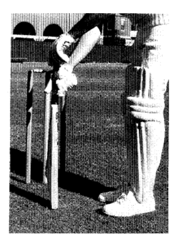
Taking guard . . . middle and leg stumps