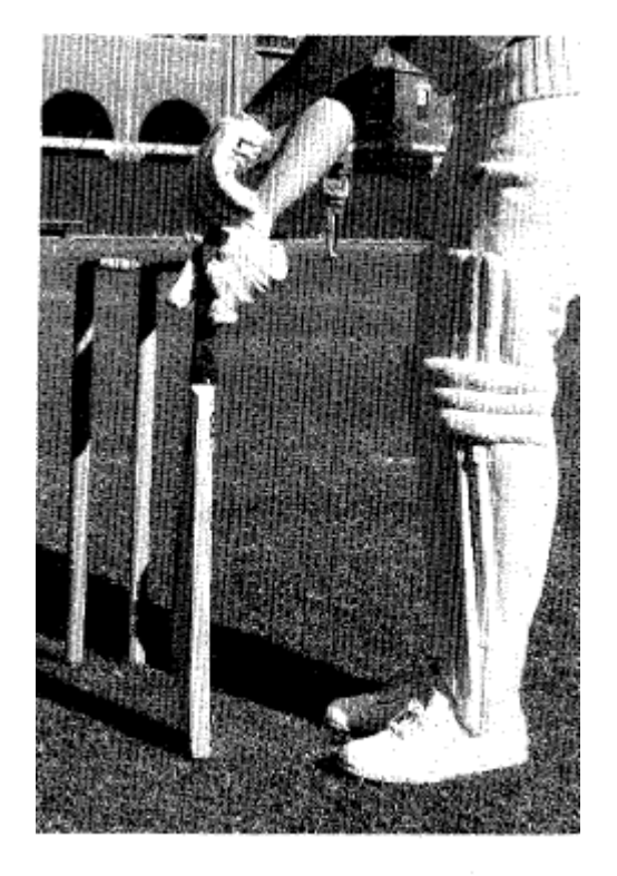
Taking guard . . . leg stump